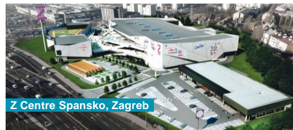
Z Centre Spansko, Zagreb

In the previous period rents remained stable, while prime yields for high-street locations remained at the level of 7.00%, prime shopping centres at 7.25%, and for retail parks 8.50%.